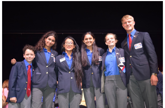
Georgia TSA officers at Nationals